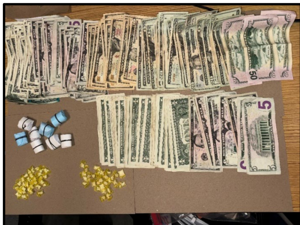
August 10, 2024 Arrest of Felix Cuevas